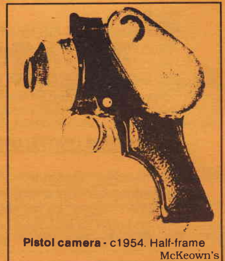
Pistol camera - c1954. Half-frame McKeown's

Answer: This half frame camera is shaped like a pistol and aptly named 'Pistol Camera.' It has a Sekor fixed focus f5.6 - 45 mm lens. About 250 were made and McKeown's list them at over $2,000.